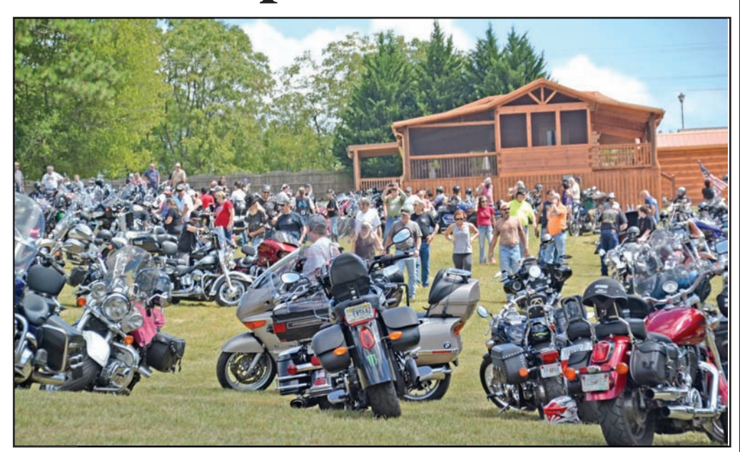
Around 900 motorcycles, including first responders and veterans from around the region, took part in the 'Ride to Remember,' which began in Athens and ended in Blairsville on Sunday,